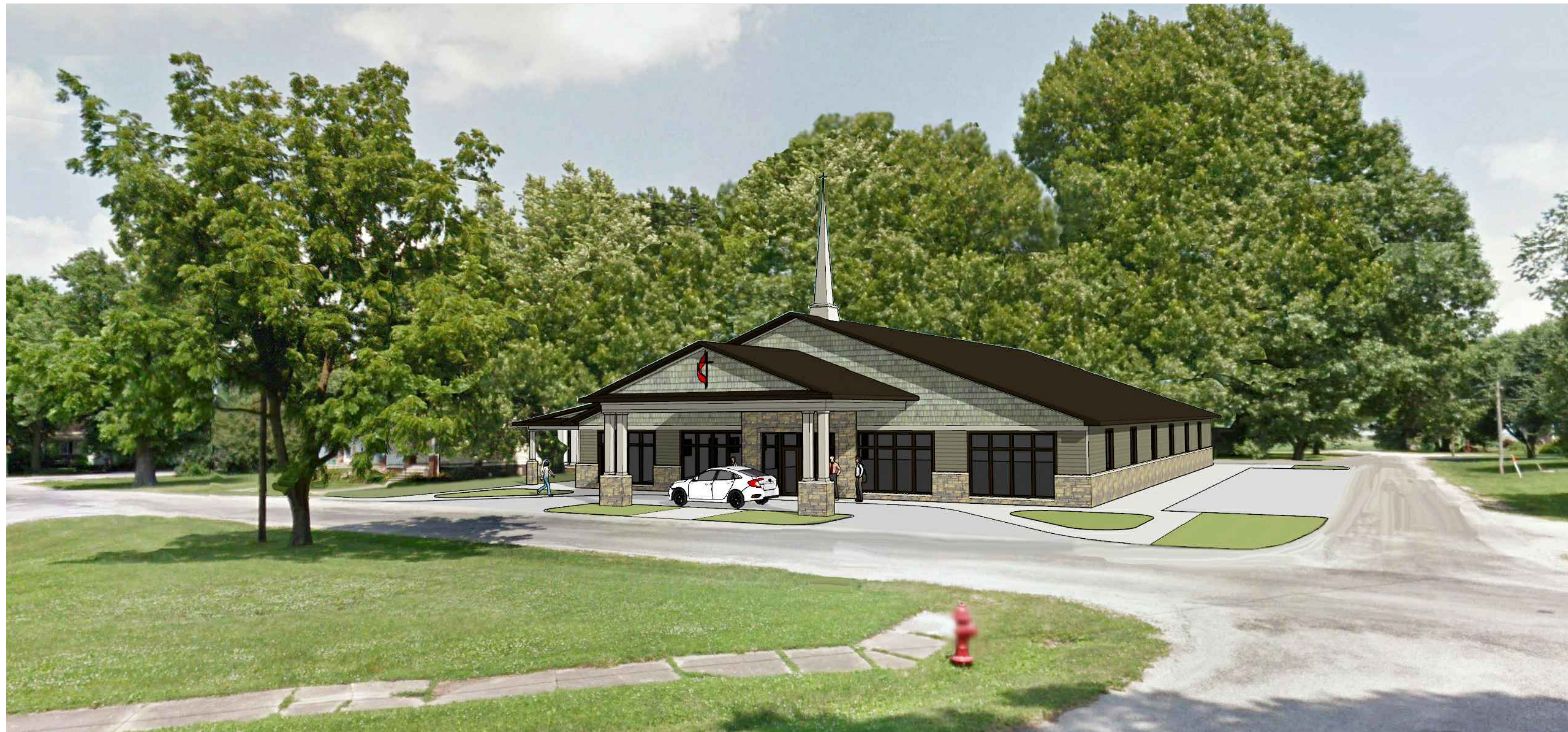
1 COLOR RENDERING A1 NO SCALE

NOTE: CONTRACTOR SHALL OBTAIN AND VERIFY ALL DIMENSIONS AND CONDITIONS AT JOB SITE AND BE FULLY RESPONSIBLE FOR SAME.